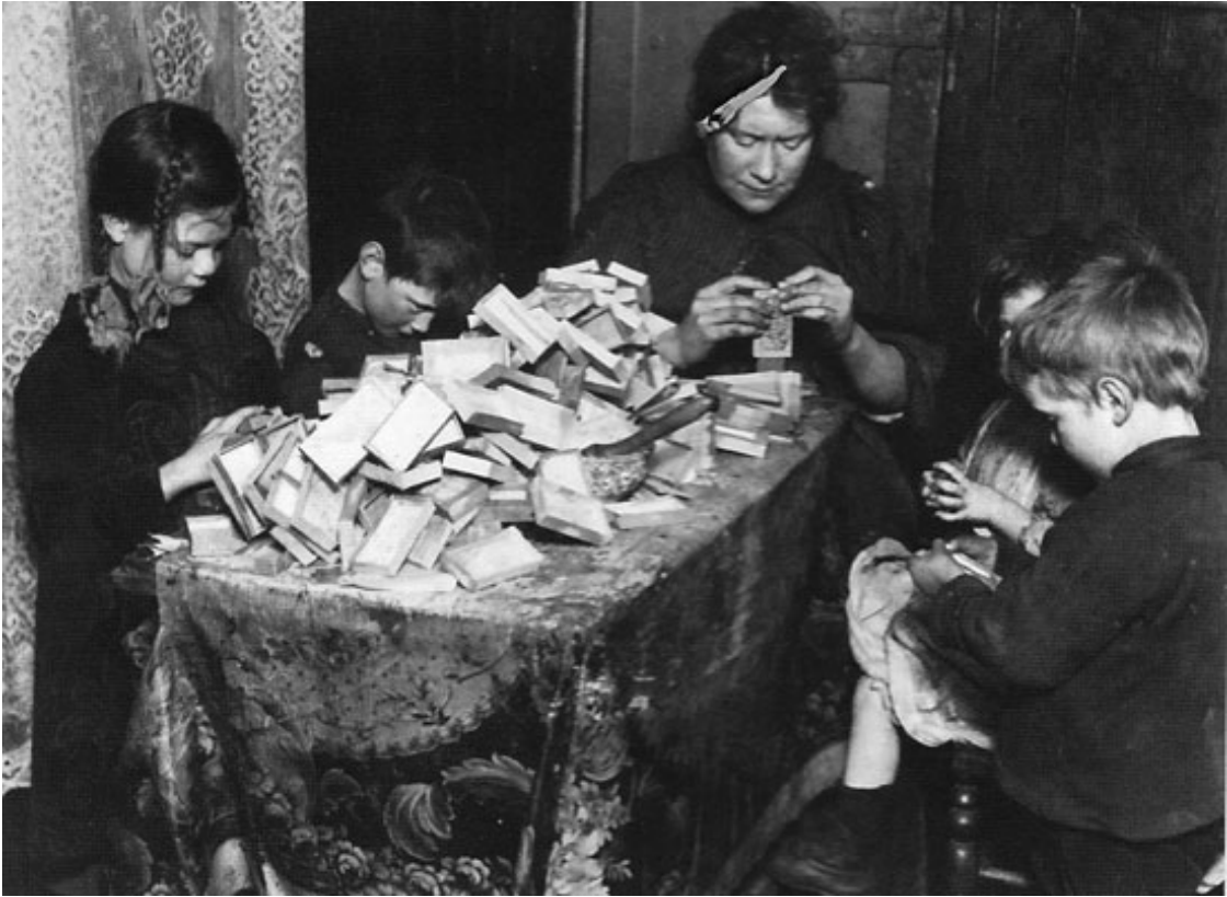
A mother and her children work at assembling match-boxes at home, c. 1900.