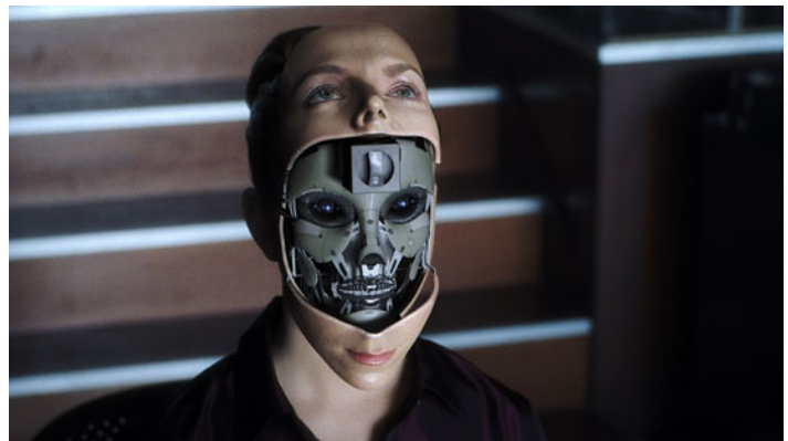
Steven Spielberg's A.I. Artificial Intelligence (2001) is based on Brian Aldiss's short story "Super-Toys Last All Summer Long."