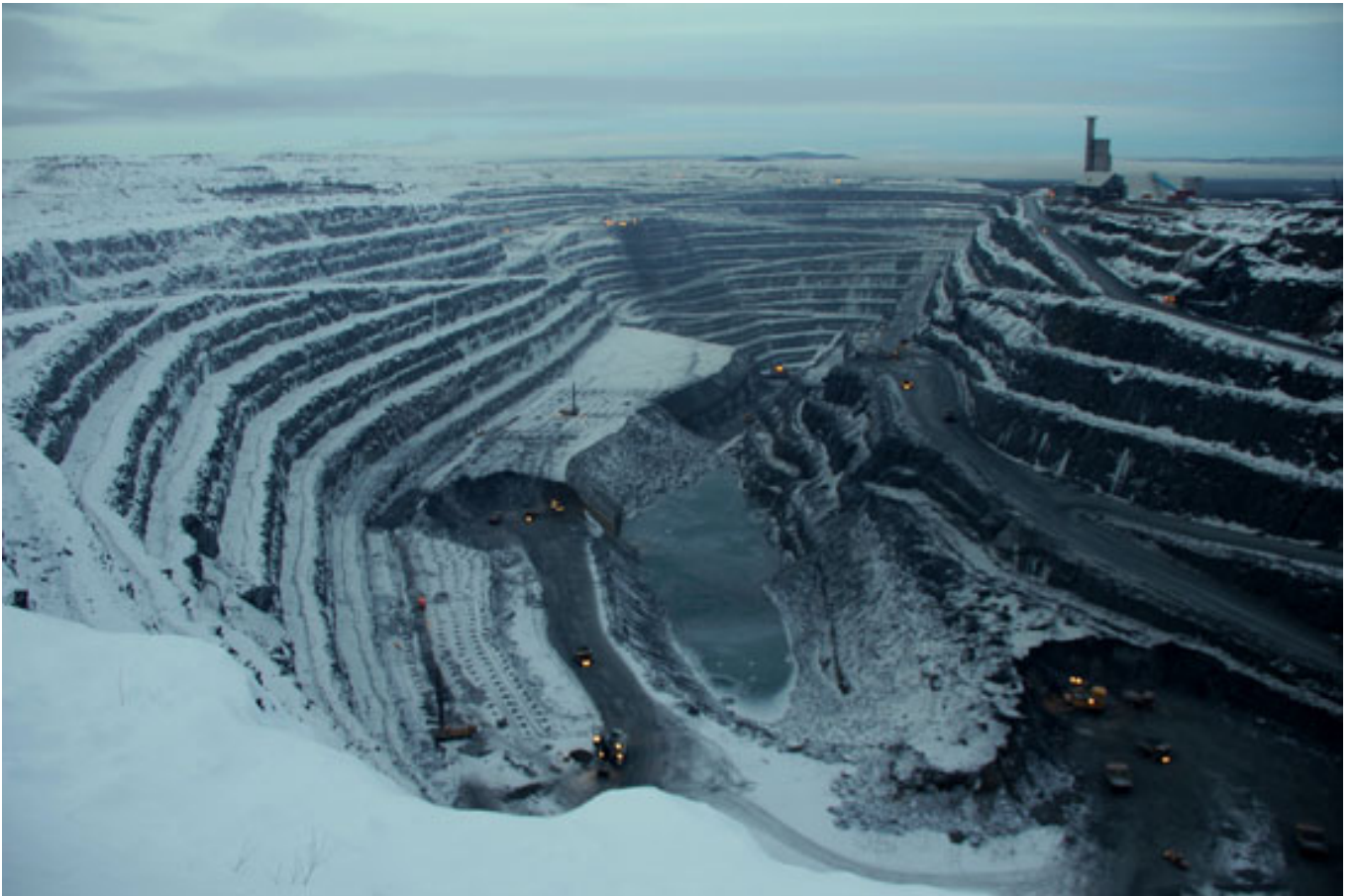
The Aitik open pit mine, currently 430 meters deep, is located about 60 km north of the Arctic Circle in Northern Sweden.