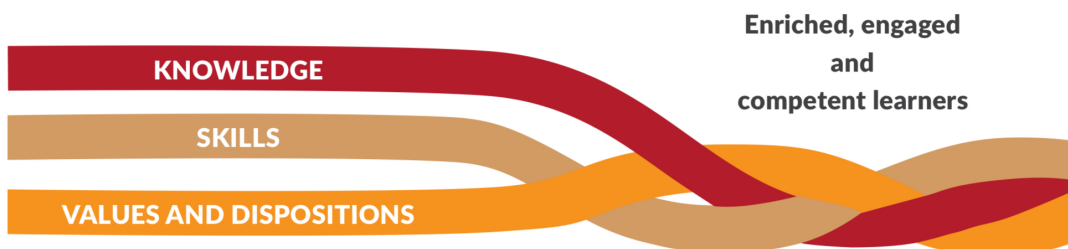
Figure 1: The components of key competencies and their desired impact

Key competencies is an umbrella term which refers to the knowledge, skills, values and dispositions students develop in an integrated way during senior cycle.