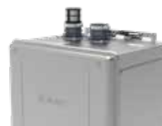
EZ-SV Single Vent (With SV-CK-2-1)

The Noritz EZ Series adapts to your installation needs, providing professional installers and their homeowner-customers with a wider range of tank-replacement opportunities.