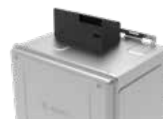
EZ-OD Outdoor (With VC-6-1)