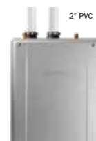
EZ-DV Direct Vent