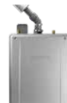
EZTR 2" Flex Vent (With EZ2-FVK1 / 2 and EZ2-CK)