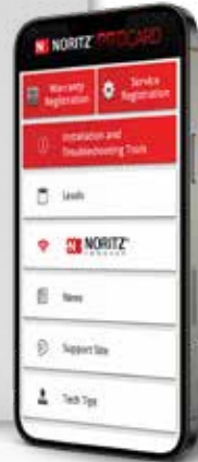
NORITZ CONNECT APP