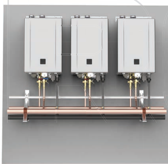
CMK / CRK QUICK COMMERCIAL MANIFOLD & RACK KITS