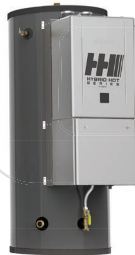
HH HYBRID HOT S E R I E S BY NORITZ