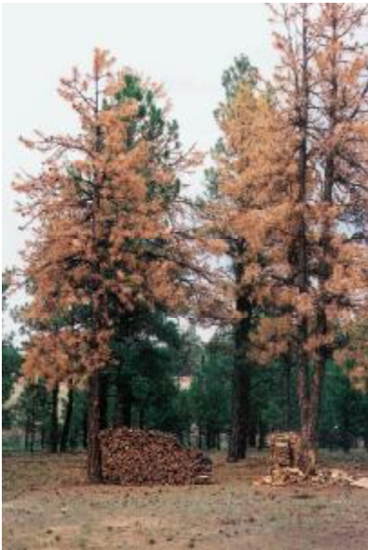
Storing cut firewood near susceptible trees greatly increases the risk of ips beetle attack.