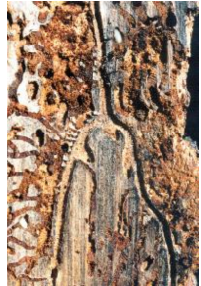
Ips pini egg galleries under bark of ponderosa pine trunk.

Colorado State University, U.S. Department of Agriculture, and Colorado counties cooperating. Cooperative Extension programs are available to all without discrimination. No endorsement of products mentioned is intended nor is criticism implied of products not mentioned.