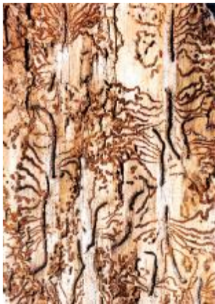
Tunneling by Ips hunteri in blue spruce.

Note: Concentrations of insecticides used to control bark beetles are often considerably greater than those used for insects on foliage. To avoid needle burning, try to limit the application to the bark, particularly when using liquid (emulsifiable concentrate) formulations that have increased risk of causing plant injuries.