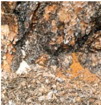
Boring dust at the base of a pine tree. Reddish boring dust is caused by ips beetles. The whitish dust is from ambrosia bark beetles.