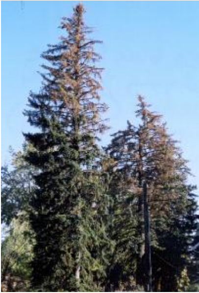
Top dieback of spruce from drought stress and ips attack.