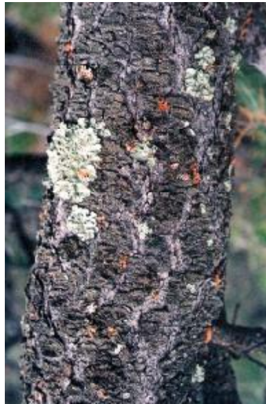
Ips confusus pitch tubes on infested pinyon pine trunk.

No chemical treatment exists for trees or wood already infested by ips beetles. In rare cases where it is feasible to reduce the threat to live trees by killing beetles within infested trees before they exit, treatments involve bark removal, chipping the wood into small pieces, covering piles with a double-layer of 6-mil thick clear plastic sealed around the edges with soil to heat (solarize) the wood, or physical removal of infested material from the site to an area a mile or more from susceptible trees.