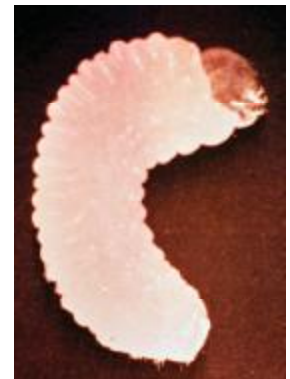
Figure 5: Larva of MPB (actual size, 1/8 to 1/4 inch). They are found under the bark in tunnels.