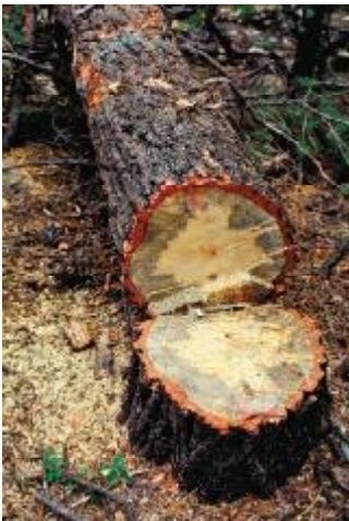
Figure 9: Cut tree killed by MPB, showing the characteristic blue-staining pattern.