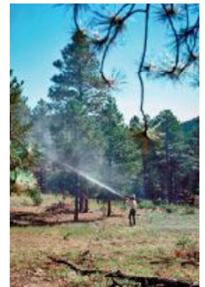
Figure 10: Large, uninfested pine being preventively sprayed. This protects high-value trees and should be done annually between April 1 and July 1.