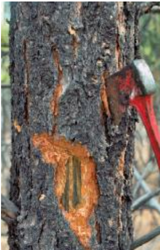
Figure 7: Checking beneath the bark for MPB. This attack was successful (note tunnels and stain).