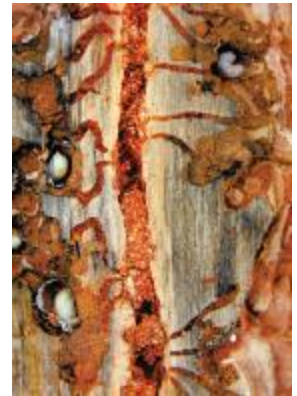
Figure 8: Characteristic tunnels (galleries) of mountain pine beetle made by the adults and larvae. The underbark area looks like this in late spring. Bluestained wood is caused by fungi the beetles introduce.

An important method of prevention involves forest management. In general, MPB prefers forests that are old and dense. Managing the forest by