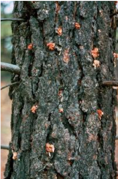
Figure 2: "Pitch tubes" indicating trunk attacks by MPB. Success of the attacks is confirmed by looking under the bark with a hatchet for beetles, their tunnels and/or bluestaining.