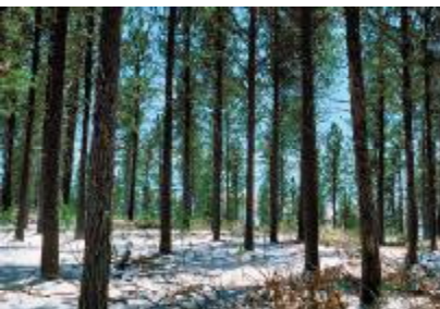
Figure 11: The appearance of a forest thinned to help prevent MPB. This can also improve mountain views and reduce fire hazard.

pine beetle, leading to early reports that “MPB is flying.” Be sure to properly identify the beetles you find associated with your trees.