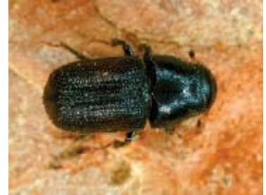
Figure 3: Top view of adult MPB (actual size, 1/8 to 1/3 inch).

Mountain pine beetle has a one-year life cycle in Colorado. In late summer, adults leave the dead, yellow- to red-needled trees in which they developed. In general, females seek out large diameter, living, green trees that they attack by tunneling under the bark. However, under epidemic or outbreak conditions, small diameter trees may also be infested. Coordinated mass attacks by many beetles are common. If successful, each beetle pair mates, forms a vertical tunnel (egg gallery) under the bark and produces about 75 eggs. Following egg hatch, larvae (grubs) tunnel away from the egg gallery, producing a characteristic feeding pattern.