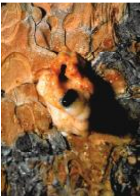
Figure 6: Not all pitch tubes indicate successful attacks. Note the beetle trapped in this large pitch tube. If the majority of tubes look like this, the tree may have survived the current year's attack.