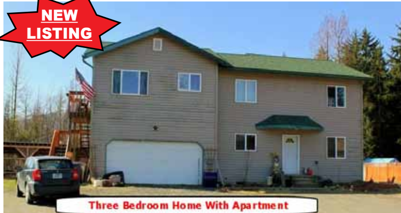
Three Bedroom Home With Apartment