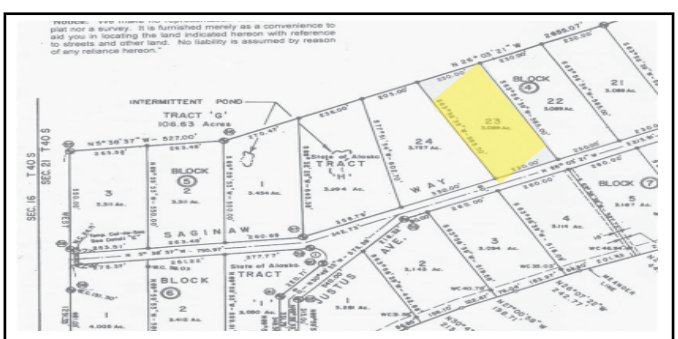
SHELTER ISLAND LOT Interior Lot #23 on the West Side of Shelter Island, 3.89 wooded acres. (MLS # 15686) ASKING >>>$25,000

Large Building Lot, 50,668 Square Feet. Upper hillside lot with lot prep and driveway done. Nice view, great location, lots of sun. If you are unable to find the right home, then just build what you want on this Very private location. (MLS #14835) ASKING $174,000.