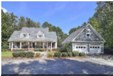
4214 Highway 378 Lake Murray, Leesville 5 BR/ 4 BA/ 4200 SF