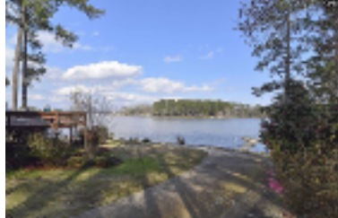
661 Braner Ct Lake Murray, Leesville 3 BR/ 2 BA/ 1700 SF