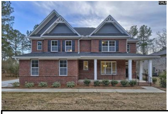
115 Southpark Pl Harbour Watch, Leesville 3 BR/ 3.5 BA/ 3343 SF