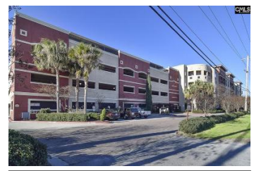
1085 Shop Rd #221 The Gates, Columbia 2 BR/ 2 BA/ 1105 SF