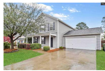
133 Hunters Mill Dr #7 west Columbis, SC 3 BR/ 2.5 BA/ 2029 SF