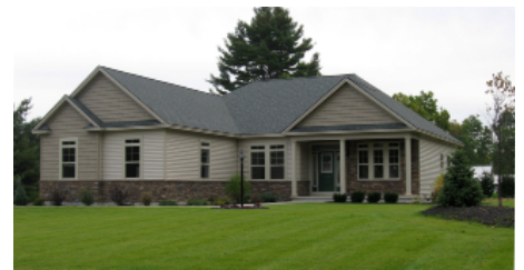
Ranch w/side entry garage

Nestled in the foothills adjacent to the West Mountain Ski Center is an enclave of (14) premium, huge, private building lots that comprise West Mountain Estates (Phase II).