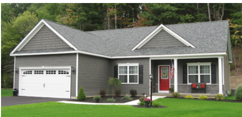
Open concept ranch plans

DIRECTIONS: Exit 18W, Go LEFT onto Corinth Rd, at 1/2 mile past West Mountain Rd, take RIGHT onto Alessia Dr.