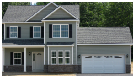
Open concept two-story plans