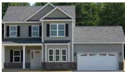
Open concept two-story plans