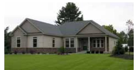
Ranch w/side entry garage

Nestled in the foothills adjacent to the West Mountain Ski Center is an enclave of (14) premium, huge, private building lots that comprise West Mountain Estates (Phase II). Each homesite is positioned for maximum privacy and mountain views. Several lots can accommodate side entry garages and walk-out basements. Customize one of our popular, open concept floorplans, or bring us your own floorplan.