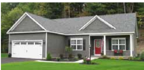
Open concept ranch plans

DIRECTIONS: Exit 18W, Go LEFT onto Corinth Rd, at 1/2 mile past West Mountain Rd, take RIGHT onto Alessia Dr.