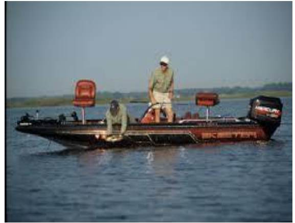
Lake Hartwell Elevation (660 = Full)

Based on the Fish and Gamer Forecaster, the middle morning is good and there is a very good to excellent midafternoon feeding period this weekend.