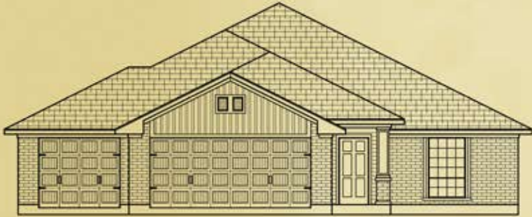
EF 2273 ELEVATION A