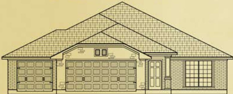
EF 2273 ELEVATION B