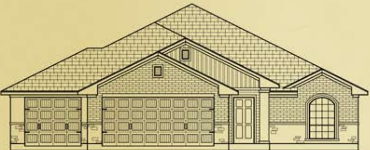
EF 2273 ELEVATION C