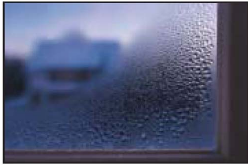
Condensation on the inside of a windowpane.

■ Keep indoor humidity low. If possible, keep indoor humidity below 60 percent (ideally between 30 and 50 percent) relative humidity. Relative humidity can be measured with a moisture or humidity meter, a small, inexpensive ($10-$50) instrument available at many hardware stores.