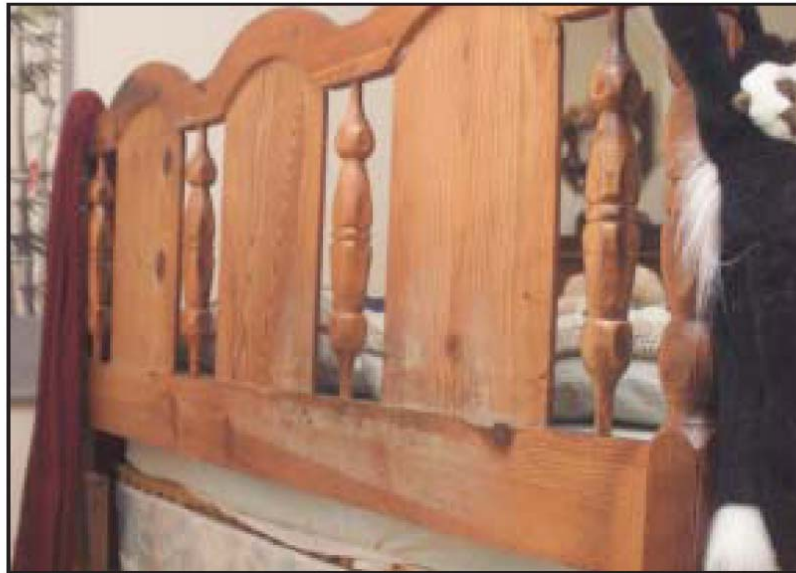
Mold growing on a wooden headboard in a room with high humidity.