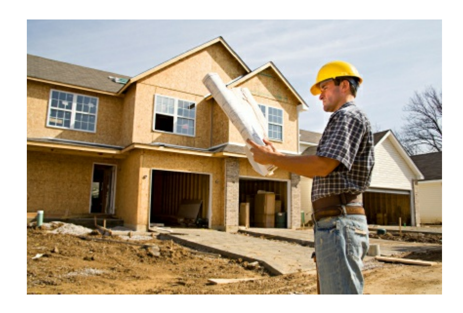
Top 10 Reasons Home Buyers Prefer New Homes vs. Used

From knowing you're the first homeowner to smelling that new home smell, there are a lot of reasons to prefer new. Here are ten!