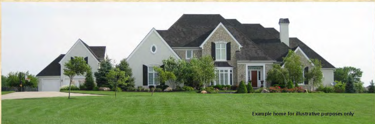
Example home for illustrative purposes only