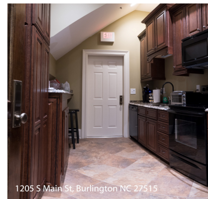
1205 S Main St, Burlington NC 27515