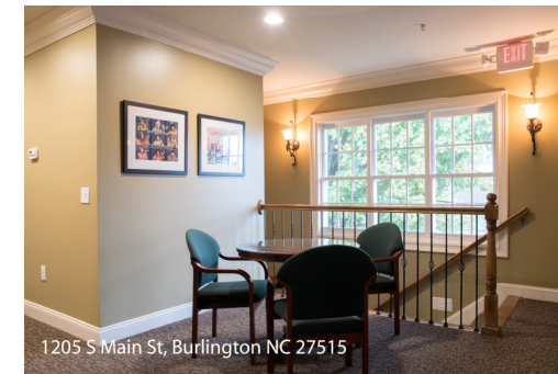
1205 S Main St, Burlington NC 27515