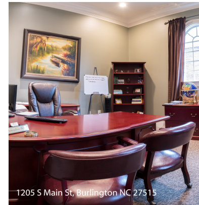
1205 S Main St, Burlington NC 27515