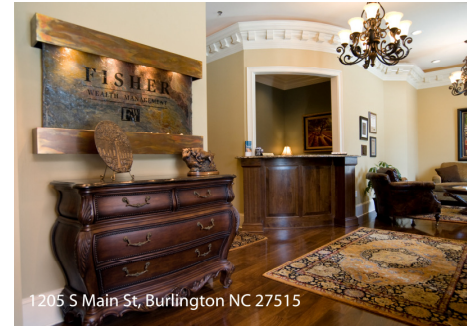
1205 S Main St, Burlington NC 27515