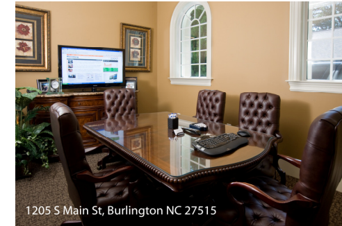
1205 S Main St, Burlington NC 27515