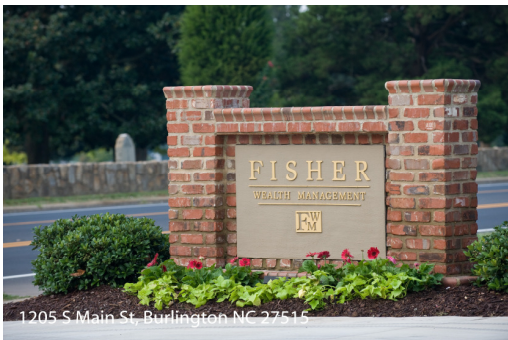
1205 S Main St, Burlington NC 27515