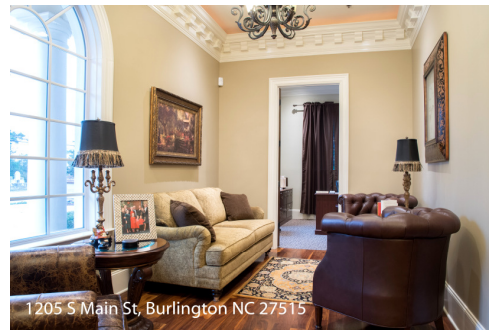
1205 S Main St, Burlington NC 27515