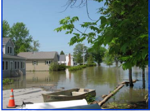
Bay Road, Long Point - May 2011