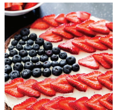
Photo & recipe courtesy of jocooks.com https://warranty.life/2HRIGbE

Arrange berries over the cream cheese mixture.