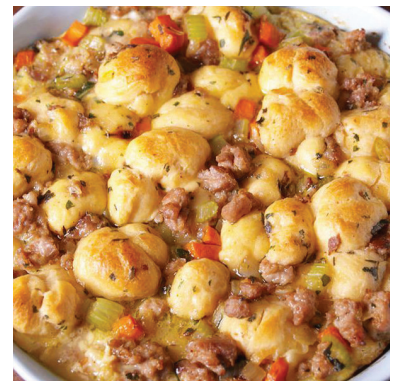
Photo & recipe courtesy of delish.com https://warranty.life/2DN1tH4

4. Cut crescent roll triangles into thirds then roll each piece into a ball. In a large bowl, combine crescent roll balls with sausage mixture, egg and chicken stock. Transfer to a medium casserole dish. Bake for 45-60 minutes, until the top is golden brown and the dough is cooked through. If the topping is browning too quickly, cover the dish with foil.