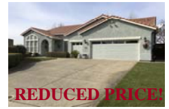
REDUCED PRICE! 2301 Pioneer Way 3 bed 3 bath 2,639Sq ft. $649,000