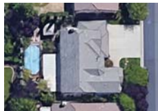
The Vianza Community in Roseville 6 beds 5 baths 3,609 sq ft $690,000