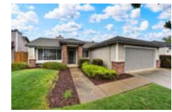
4702 Durham Court 3 beds 2 baths 1,238 sq ft $400,000