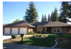
8309 Niessen Way 4 beds 3baths 2,135 sq ft $501,000