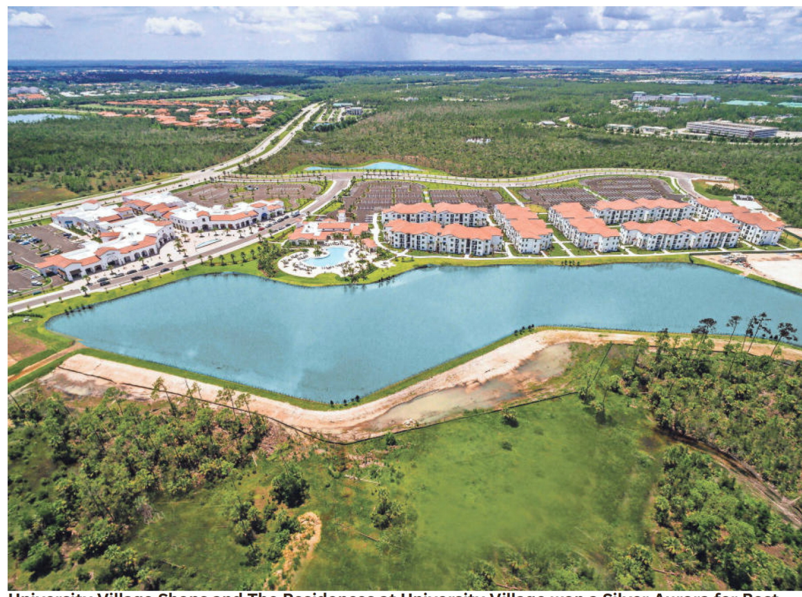
University Village Shops and The Residences at University Village won a Silver Aurora for Best Commercial Project - 20,000 square feet & over.

Silver Auroras: Best Bath Design Custom/ Spec/One of a Kind Home: Private Residence, Talis Park - Seneca Way, Naples; Builder: Fox Builders; Developer: Kitson & Partners; Architect: Satar Design; Interiors: Collins & DuPont Design Group; and Today's Traditional, Naples; Builder: Specialty Building Services (SBS); Interiors: W Design