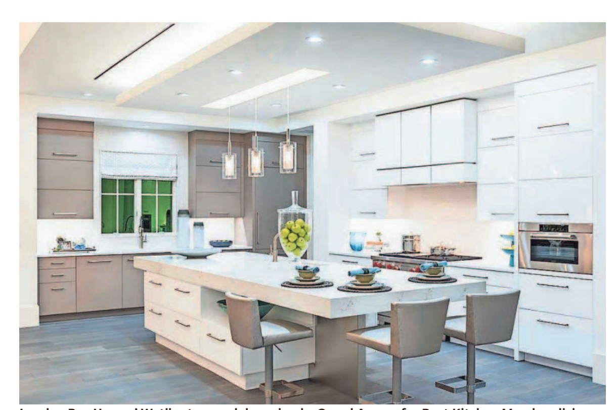
London Bay Homes' Watlington model received a Grand Aurora for Best Kitchen Merchandising of a Home priced over $800,000. SUBMITTED