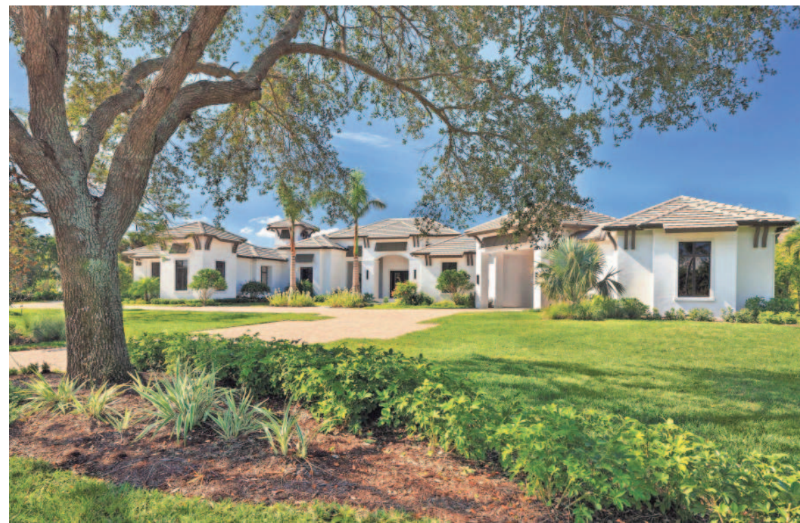
Diamond Custom Homes won a Silver Aurora in the Best Custom Home over 8,000 square feet category for this private residence in Quail West. SUBMITTED

Silver Auroras: Best Interior Detailing for a Home priced $1,000,001 - $2,000,000: Marino, Bonita Springs; Builder: Calusa Construction; Developer: GKW LLC; Architect: RG Designs; Interiors: Monica Soltis Interiors; and Private Residence - Port Royal, Naples; Builder: BCB Homes; Architect: Stofft Cooney; Interiors: Collins & DuPont Design Group