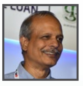
Know More >>