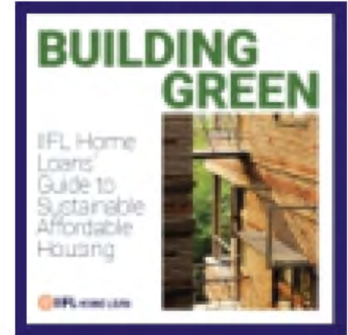
IIFL HFL's Guide to Sustainable Affordable Housing