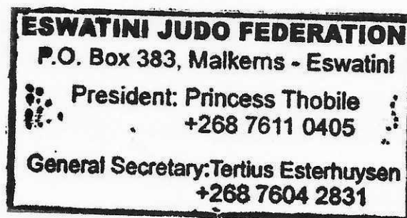
Princess Thobile President - EJF

A handwritten signature in black ink, appearing to read "Thobile", is written over a horizontal line.