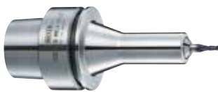
Photo shows HSK40EN-MMC4-65-AT

High Accuracy and High Gripping Torque by rigid and smooth shape body