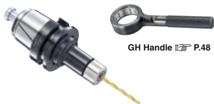
GH Handle P.48

"SK-P" is the Code No. of High Speed Slim Chuck.