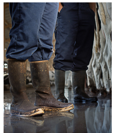
We are a Boots-On-The-Ground Company