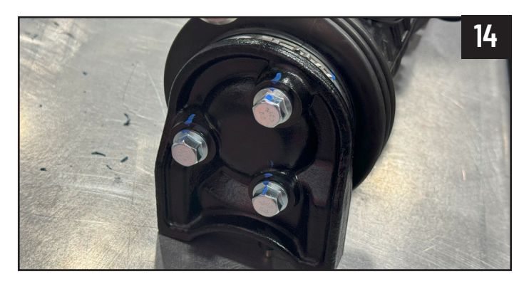
Remove passenger side endcap 3X 13mm bolts only, do not remove the endcap.