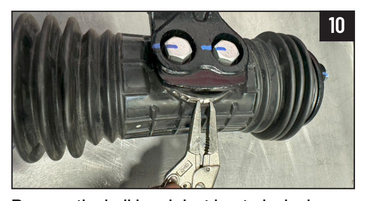
Remove the bulkhead dust boot pinch clamp.