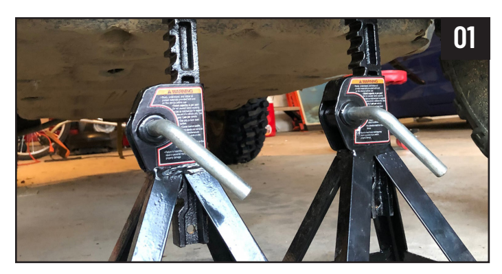
Safely raise and support the front end.