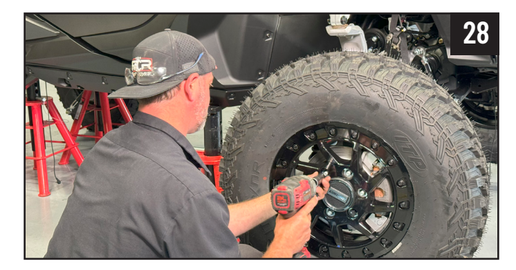
Re install the wheels, safely lower the vehicle.