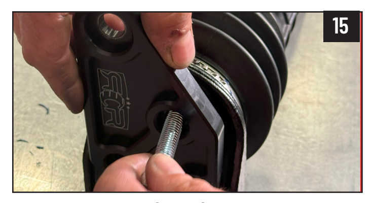
Loosely Install the SANDCRAFT Passenger Side Bracket with the included 8mm x 40 allen hardware, writing facing out. Use red threadlocker.