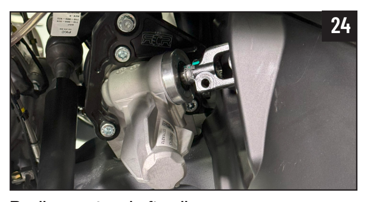
Realign sector shaft splines.