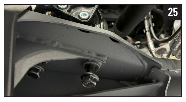
Install the 4X steering rack bolts through the frame. Use red threadlocker, torque to 77 ft lbs.