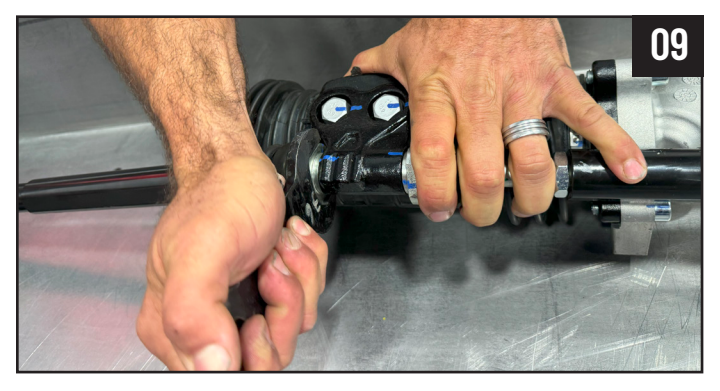
With the rack out of the vehicle, remove the inner tie rod ends from the factory bulkhead (36mm).