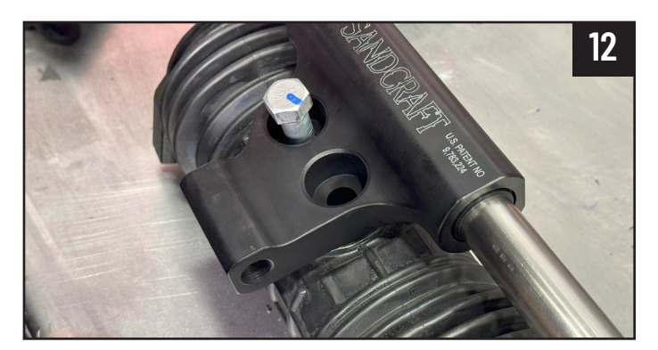
Loosely Install the SANDCRAFT SRS body into the factory bulkhead location using the factory 19mm bolts. Use red theadlocker.