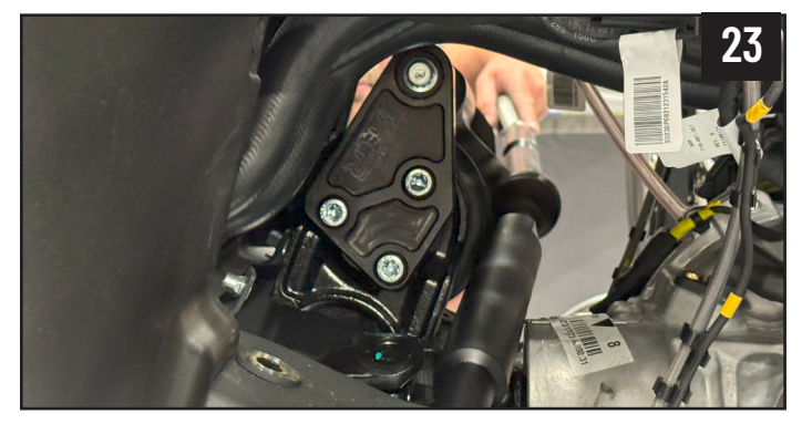
Re install steering assembly back into the vehicle.