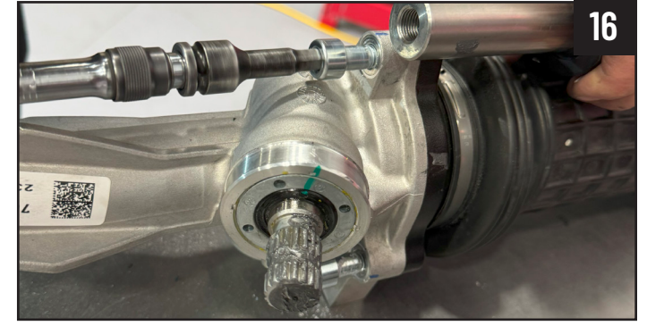
Remove driver side endcap hardware 3X 13mm allen bolts only. Do not remove the endcap.