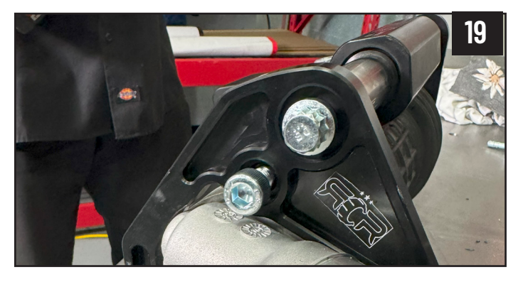
Loosely install 2X included cross bar 12 point ½" bolts through the brackets into the crossbar using red threadlocker.

Now that the stabilizer is loosely installed, you can torque all the hardware.