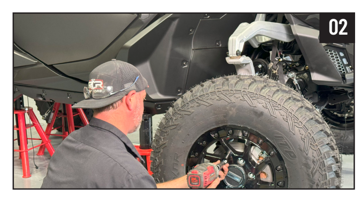
Remove both front wheels.