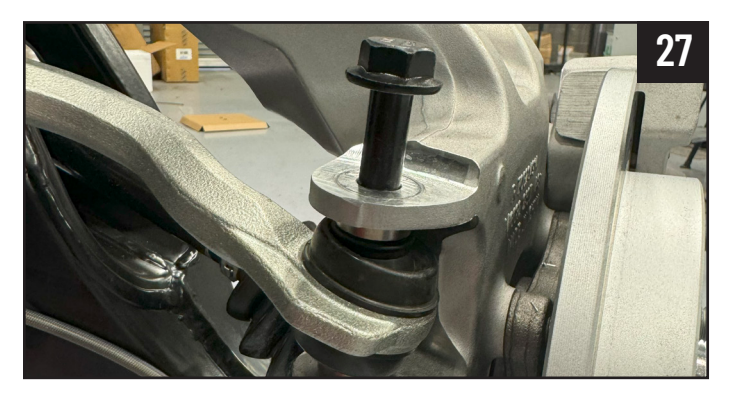
Re install the tie rod outers torque to 77 ft lbs. Double check alignment, then tighten the jam nuts to 40 ft lbs.