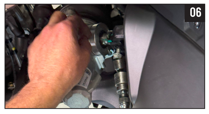
Remove sector shaft to the steering pinion pinch bolt (13mm). Mark the spline's alignment for reassembly.