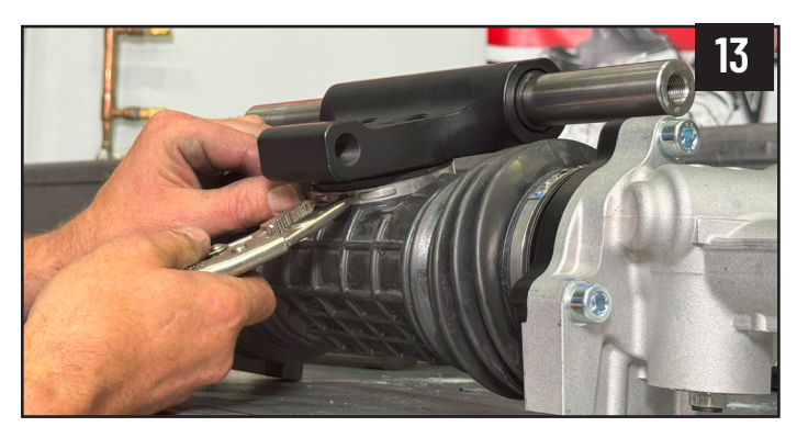
Re install the bulkhead dust boot pinch clamp.