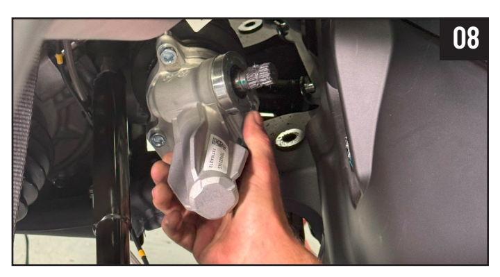
Remove the steering rack assembly from the vehicle.