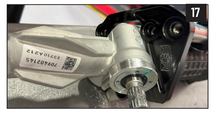
Loosely install the SANDCRAFT driver side bracket over the endcap with writing facing out.