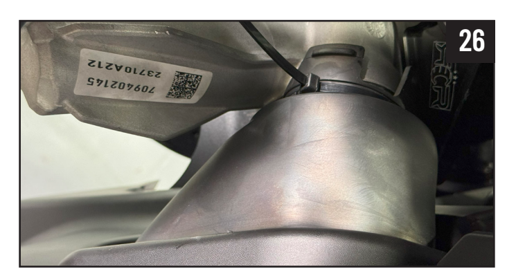
Tighten the sector shaft pinch bolt torque to 22 ft lbs. Re install the dust boot and rivets.