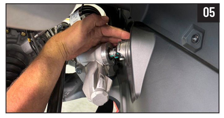
Cut the zip tie at the steering column boot and remove inner footwell plastic rivets to push the boot out of the way.