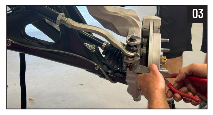
Loosen both inner and outer tie rod jam nuts. Mark the jam nut for correct alignment during re installation.