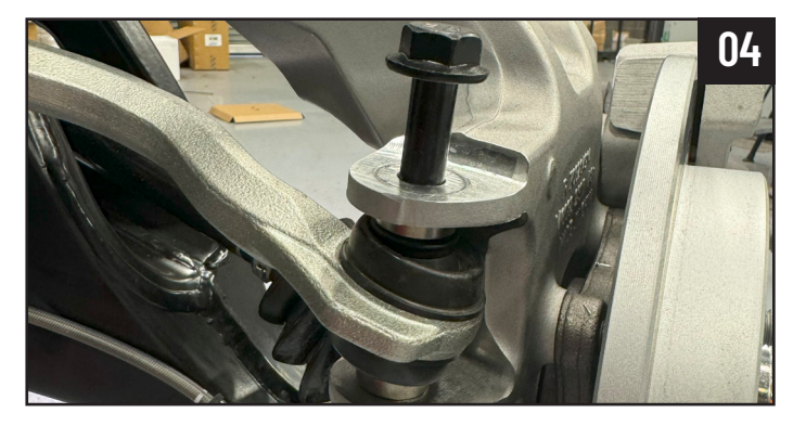
Remove both outer tie rod ends from the knuckles (18mm).