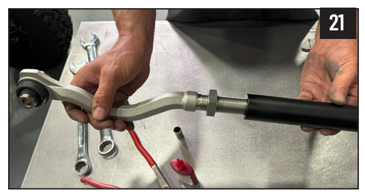
Transfer inner and outer tie rod ends from the old tie rods to the new SANDCRAFT tie rods. Leave the jam nuts loose at the time.