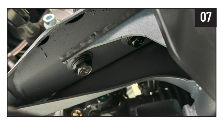
Remove 4X 18mm mounting bolts mounting the steering rack to the frame.