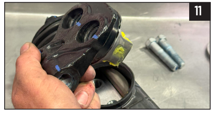
Remove 2X 19mm bolts mounting the bulkhead to the factory rack, remove the factory bulkhead.