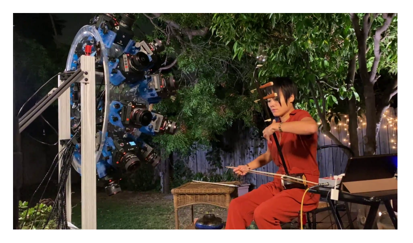
Figure 1: Our mid-range light field video camera array (left) consisting of 24 Z CAM E2 professional 4K cinema cameras mounted to a sturdy acrylic hemisphere is seen recording a performance of a traditional erhu instrument.