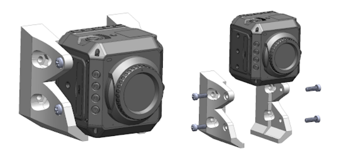
Figure 3: 3D printed brackets hold the cameras securely to the dome at four mounting points.

one hemisphere in the rig, this approach makes it possible to form an evenly spaced spherical arrangement of 48 cameras using two hemispherical domes. From the analytic technique of [Broxton et al. 2020], our array sees each point in the scene in at least three views as long as it is no closer than 50cm from the camera lenses, with about 22cm between camera lenses.