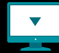
ESET MSP ADMINISTRATOR

Activate multiple products at once with ESET Endpoint Protection Standard and ESET Endpoint Protection Advanced.