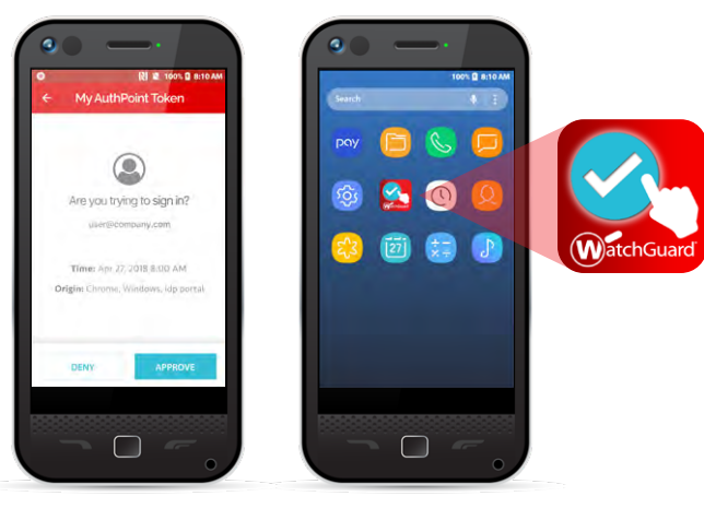
AuthPoint Mobile App