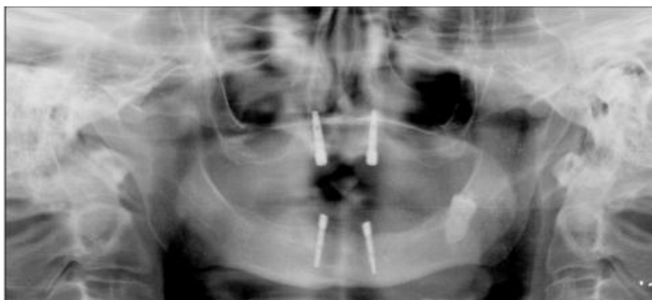
Figure 2: Panoramic radiograph of the endosseous dental implants in the maxilla and mandible.

Therefore, Two dental implants were placed in general anesthesia in the maxilla and mandible, each of them at the region of the canines (Figure 2.). The length of each implant was 13 mm, the platform had a diameter of 4.3 mm in the maxilla, and 3.5 mm in the mandible.