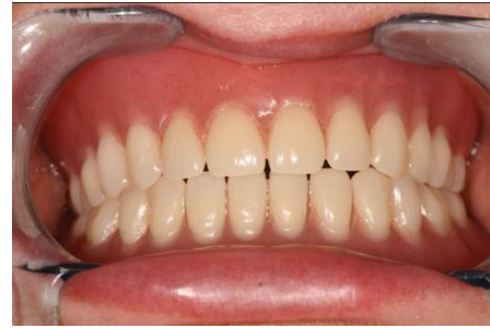
Figure 3: Definitive implant-supported prosthesis in function for over 12 months.

The definitive baseplate was reduced palatally because of an increased gag reflex sensitivity. The locator male was placed by the dentist directly in the patient's mouth, and fixed with a self-curing acrylic resin Meliodent (Heraeus Kulzer, Hanau, Germany) into the recess of the base. A white block-out spacer was first placed over the head of each locator abutment, to block out the immediate surrounding area. This allowed the full resilient function of the pivoting metal denture cap. The dentures in centric occlusion were maintained in passive condition, without pressing the soft tissues. After the acrylic resin was cured, a white colored replacement nylon male was placed into the maxillary denture, and a red colored replacement nylon male was placed into the mandibular denture to correct the divergence of implants, which was over 10° in the mandible in the present case. As a good oral hygiene is essential for implant success, the patient and her husband were taught how to clean the implants thoroughly by an end-tufted toothbrush, superfloss and water. The importance of a follow-up examination after three months was explained to the patient in order to detect early any tilting of the dentures and to prevent dislodgement of the implants. Patient compliance was good, as she appeared for regular follow-up.