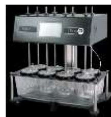
Figure 3: Disintegration Test Apparatus.

Six randomly chosen tablets of each brand were tested for tablet disintegration time at 37°C using a disintegration equipment with distilled water used as the test fluid. The point at which there were no more tablet granules on the mesh was considered to be the disintegration time.