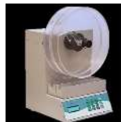
Figure 2: Friability Test Apparatus.

% Friability is equal to [(Start weight - End weight)/Start weight] x 100.