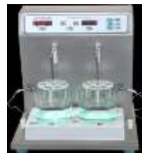
Figure4: Dissolution Test Apparatus.

solution of the medication levetiracetam. Using the concentration and percentage.