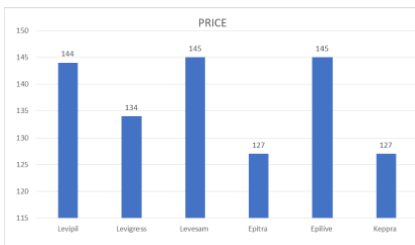
Figure 5: Price Comparison of All Brand.