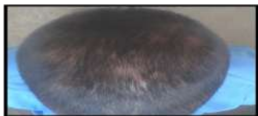
Figure 2 (A) Before Treatment (B) After Treatment