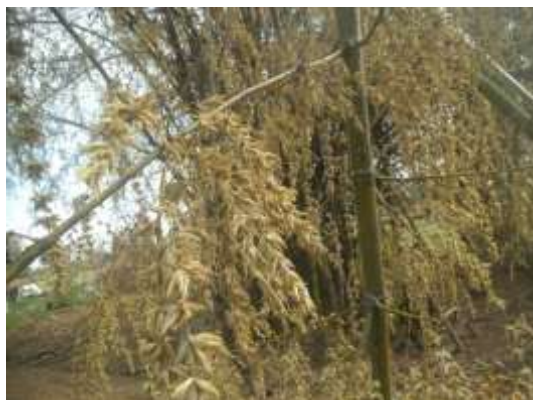
Flowering and fruiting