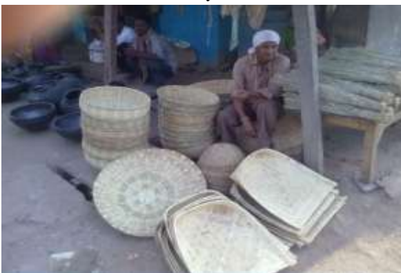
handicrafts at market