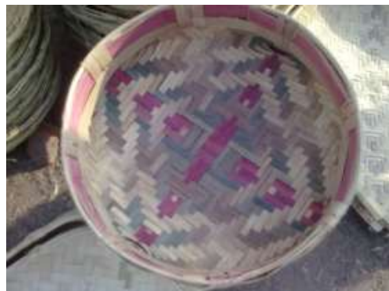
Kudo (Measuring apparatus)