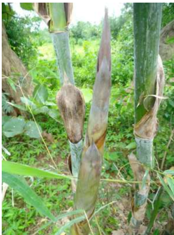
Edible shoot of bamboo