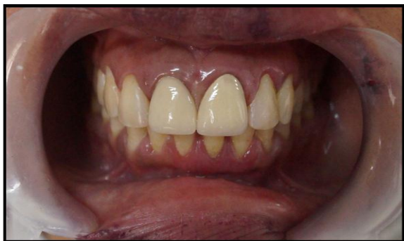
Fig. 5 Final post-operative view

After 1 week the all-ceramic crowns were cemented using dual-cure resin cement (Luxacure, DMG America). The patient was completely satisfied with new smile (Fig. 5).