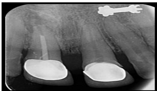
Fig.2 Pre- operative IOPA

The retreatment (RCT) irt 11 and root canal treatment irt 21 was done through the PFM crowns (Fig. 3).