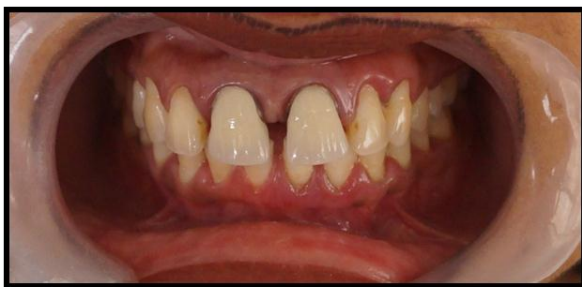
Fig. 1 Pre- operative intraoral View

After thorough clinical and radiographic examination and patients expectations for esthetics, the All- ceramic crowns irt 11 and 21 and direct composite resin build-ups irt 12 and 22 were planned with her consent.