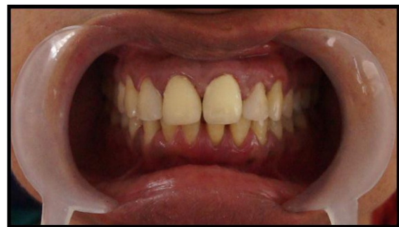
Fig. 4 Intra-oral View after cementation of temporary crowns and composite build-ups

The temporary crowns (as a part of indirect intra-oral mock-up) were made with the help of cold cure auto polymerizing resin irt 11 and 21 using A2 shade on the working casts. The temporary crowns were cemented with the help of zinc oxide temporary material. This was followed by direct composite resin build-up irt 21 and 22 (Fig. 4).