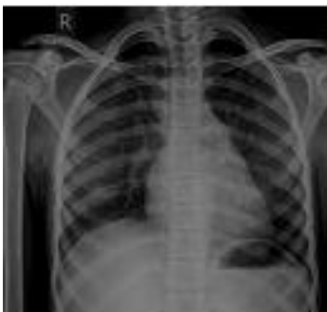
Figure 1: Chest X ray PA view shows straightening of left heart border

Investigation showed normal total leukocyte and differential count, platelet count. Hb was 8.2gm%, ESR -30mm at end of first hour, ASO titer 466 IU/dl and CRP was negative. ECG showed sinus rhythm. Chest X ray shows straightening of left heart border. In echocardiography, anterior and posterior mitral leaflets were thickened, fixed with restricted mobility with critical mitral stenosis (<0.69sqcm) with pressure gradient 20/12 mmHg and severe pulmonary hypertension and mild tricuspid regurgitation without vegetation. She was treated with antibiotics, diuretics and referred to cardiologist for mitral valvotomy. Valvotomy was done successfully and put on penicillin prophylaxis and discharge after 3 weeks after surgery. She was in regular follow up and symptomatically better.