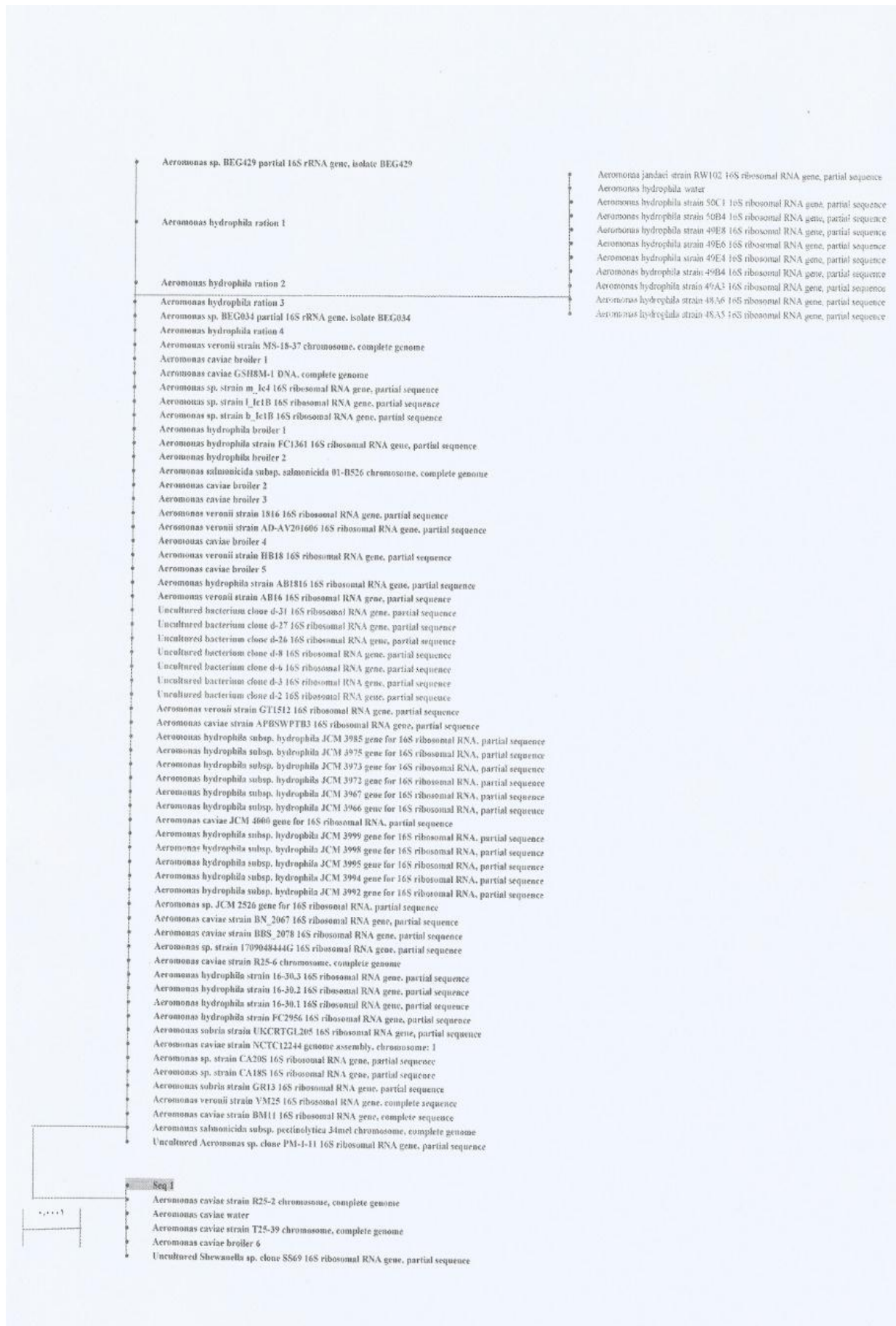
Fig. 3: Phylogenetic tree based on sequencing of the 16S rRNA genes of Aeromonas strains.