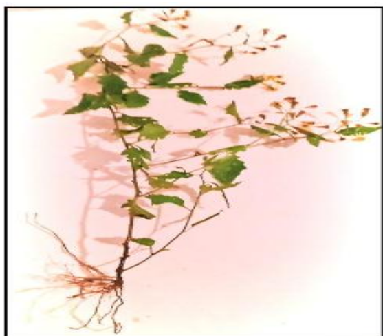
Figure 3: Total structures of medical plant species ( Senecio L. ) by Long-time investigation.

Fourthly, this research proposed that the medicinal plant species ( Senecio L. ) is local in the six typical landscape types (forests, mixed between forests and grassland, mixed between forests and wetland, mixed between forests and river, mixed between forests and eco-urban, mixed between forests and countryside) by the “big data” of this plant roots moisture investing along elevation, because there may be results that there are not only dynamics of natural environments, there are but also dynamics of climate environmental factors from 500m to 1500m along elevation gradient.