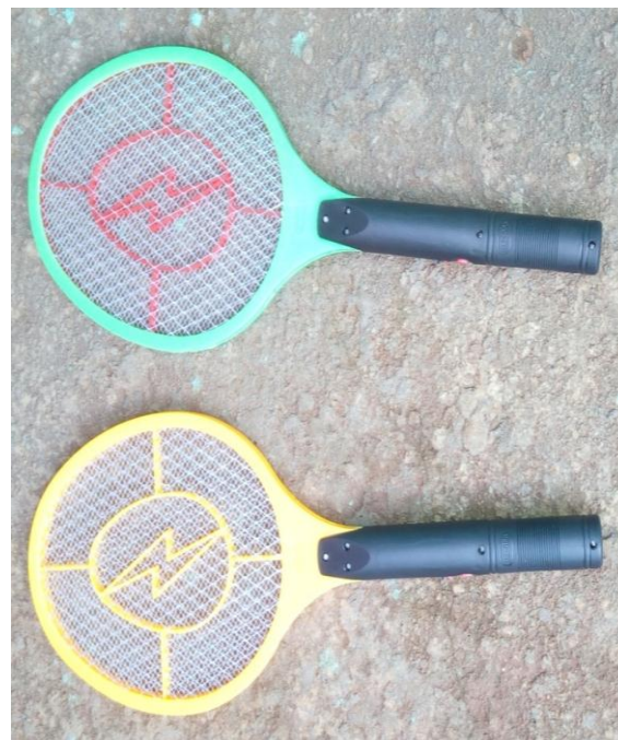
Fig.2: Electronic rackets used during the mosquito collection on the field.

Four bedrooms were chosen or selected for adult mosquito collection in the morning in July 2019 during the rainy season in Dogbo district. Mosquitoes resting in the houses were collected by electronic racket (Fig.2) from 6 a.m. to 7 a.m. The survey was done for fourteen consecutive nights (two weeks). All collected mosquitoes were put in netted plastic cups and transferred to the Laboratory of Applied Entomology and Vector Control (LAEVC) of the Department of Sciences and Agricultural Techniques located in Dogbo district for identification.