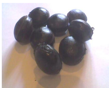
Fig. 1 Mucuna urens seeds

Despite being nutritionally promising, Mucuna has been reported to contain some endogenous toxic factors. Relatively high concentration of tannins, phytic acid, cyanogenic glucoside, oxalate and gossypol have been reported in Mucuna (Laurena et al , 1994). Toxic compounds including L-DOPA (3,4-dihydroxy-L-phenylalanine), nicotine, physostigmine and serotonin have also been reported in Mucuna . These factors negatively affect the nutritive value of the beans through direct and indirect reactions; they inhibit proteins and carbohydrate digestibility; induce pathological changes in the intestine and liver tissues, thus affecting metabolism; inhibit a number of enzymes and bind nutrients, thus making them unavailable (Bressani, 1993). It is however believed that heat treatments reduce these anti nutritional properties of the seeds (Umoren et al , 2007).