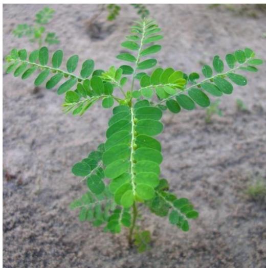
Fig. 3 Phyllanthus amarus plant