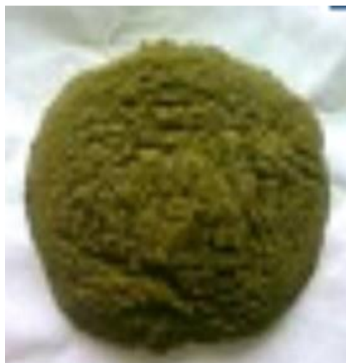
Fig. 4 Pulverized P. amarus

Qualitative phytochemical evaluation of the components of these herbs was carried out after which TLC profiling towards the initial characterization of the components was also preformed. Thin Layer Chromatography was chosen over other chromatographic methods because it is a simple, quick and inexpensive procedure that can be used for the analysis of mixtures.