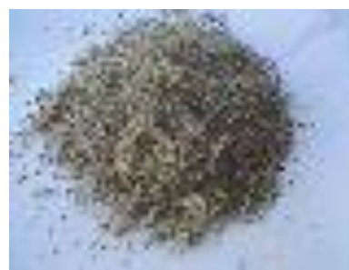
Fig. 2 Pulverized seeds

Phyllanthus amarus belongs to the family Euphorbiaceae. It occurs as a weed throughout the Southern and Western part of Nigeria. It is best known by the common names stone breaker, carry-me-seed, gale wind grass, hurricane weed and quinine weed. In Nigeria, it is called Oyomokiso-amankedem (Efik), Ngwu (Igbo), Iyeke (Urhobo) and Eyin-Olobe (Yoruba). (Etta, 2008). According to folklore medical research, the leaves are used widely by the local people for the treatment of gonorrhea, genitor-urinary diseases, asthma, diabetes typhoid fever, jaundice, stomach ache, dysentery, hypertension and ringworm (Odugbemi, 2008). Other reports claim the use of the plant juice extracted from the stem for ophthalmic condition (Idika and Niemogha, 2008). It has also been reported to possess two lignans namely phyllantin and hypophyllantin obtained from the leaves. This has been noted to enhance cytotoxic responses with cultured multi drug resistant cells (Newman and Graag, 2007). Foo and Wong (1992) have reported the presence of a tannin, phyllanthusin D in the plant. Similar reports have reported the presence of quercetin and other tannins (Rajeshkumar and Kuttan, 2002); lignans (Singh et al , 2009) and alkaloids (Houhgton et al , 1996) in extracts of the herb.