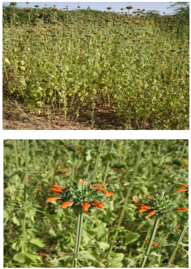
Fig.1. Leonotis nepetifolia (L). R.Br

The drug has been reported to possess wound healing,<sup>[12]</sup> antibacterial,<sup>[13]</sup> antirheumatic,<sup>[14]</sup> anti-inflammatory,<sup>[15]</sup> analgesic and anticancer activities.<sup>[16]</sup>