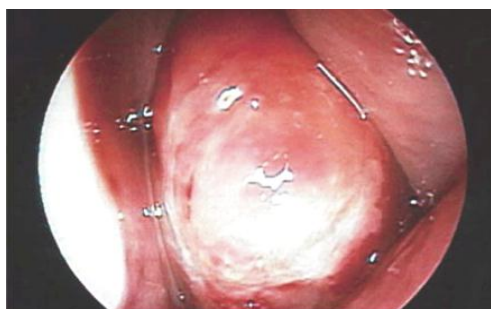
Figure 2 – DNE finding of mass in left nasal cavity