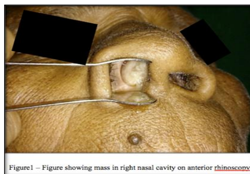
Figure1 – Figure showing mass in right nasal cavity on anterior rhinoscopy

Endoscopic excision of nasal mass was done under general anesthesia. After the procedure anterior nasal pack was kept in the left nasal cavity, which was removed after 24 hours. Postoperative period was uneventful. The histopathological report showed chondroma with proliferating chondrocytes. The patient is under regular follow up since last 6 months and has no signs of recurrence.