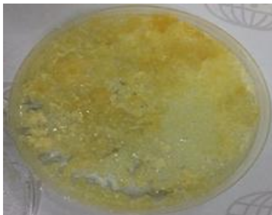
Figure 3: The chromatogram of Bisoprolol fumarate after being exposed to temperature 50 °C and relative humidity 75% for one month.