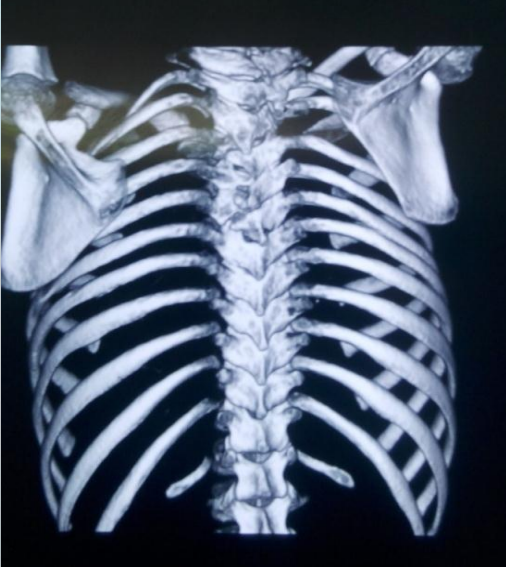
Picture. 4 Fig. four Computed tomography of the shoulder blades of the same patient, which determines the high standing of the shoulder blades on the right II degree.

A study of the history of the disease and a survey of parents revealed the following: 44 mothers out of 85 sick children were pregnant against the background of toxicosis, among them 38 mothers had toxicosis in the first half of pregnancy. In addition, 32 mothers have suffered from an acute respiratory disease during pregnancy and 9 mothers were in inbred marriages. In