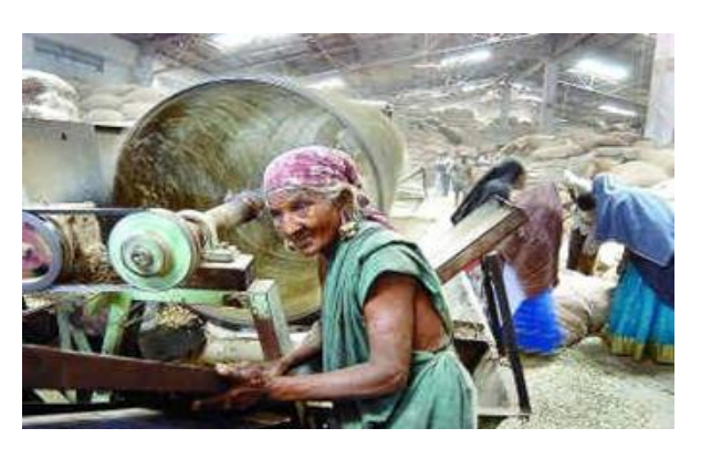
India's exports growth in senna leaves over the years Demand has grown and exports are on the rise despite price fluctuations

The global interest in this plant and the high demand for its leaves provide ample scope to cultivate this plant on commercial scale. Other opportunities for cultivation include: Present price for leaves is attractive, crop gives economically remunerative returns in comparison to traditional crops, ease of cultivation under rainfed condition, the crop can be integrated with traditional crops through crop sequencing, opportunities for marketing leaf and seed exist, bye-products can be profitably be utilized, value addition can increase profits, however, current exports are limited and large scale exports of leaves and value added products need to be explored. [2]