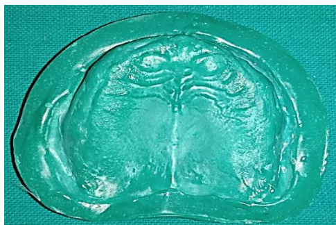
Fig 1 maxillary master cast

Wax up done followed by clear acrylic stent with imprints of rugae was placed on maxillary trial denture base, adapted carefully on the palatal portion of the maxillary trial denture base. (Fig 7) After deflasking the prominent rugae were observed (Fig 8) followed by curing, finishing and polishing. (Fig 9).