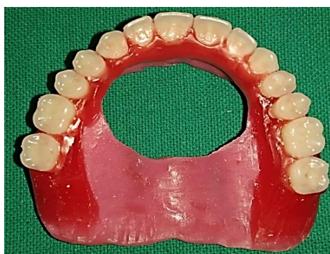
Fig 6 removal of rugae area