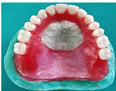
Fig 7 adapted acrylic stent