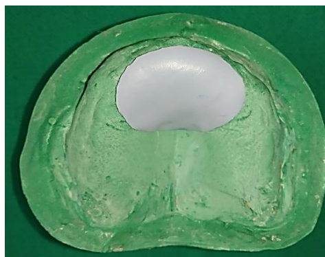
Fig. 3: Duplicating Rugae With Putty