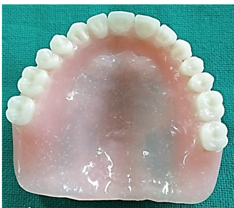
Fig. 9: Final Denture With Duplicated Rugae.