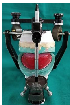
Fig. 5: Jaw Relation And Mouting On Articulator.