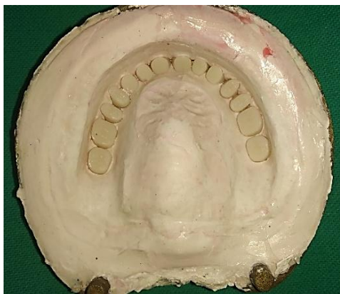
Fig. 8: Prominent Rugae Duplicated In Plaster Seen After Dewaxing.