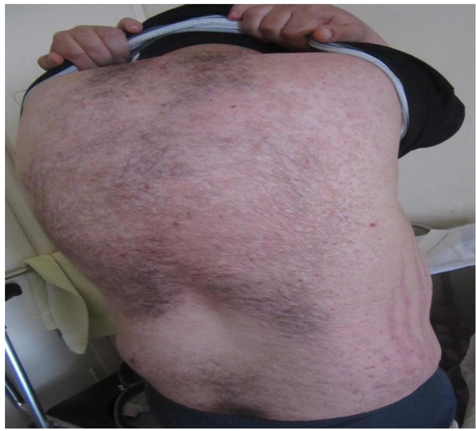
Figure 2: Posterior image of the patient showed the dorsal hyper-kyphosis.