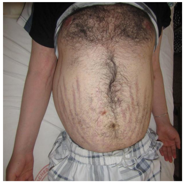
Figure 1: The image of the patient abdomen showed the truncal obesity with violaceous striae.

In absence of treatment, AVNFH can lead to a complete collapse of the femoral head necessitating total hip replacement in up to 70% of patients.<sup>[16]</sup> In case of AVNFH due to endogenous hypercortisolaemia, the majority of the described patients were treated surgically with core decompression surgeries, osteotomies or total hip arthroplasties.<sup>[9, 17-19]</sup> In some cases, the medical therapies such as bisphosphonates, non-steroidal anti-inflammatory and low molecular weight heparin (LMWH), have been evaluated with varying clinical outcomes.<sup>[20-22]</sup> Our patient received an intravenous perfusion of 5 mg of Zoledronic acid to stop the progression of the hip necrosis. There is some studies suggesting that statins can prevent osteonecrosis, but our patient was never exposed to this treatment.<sup>[23]</sup>