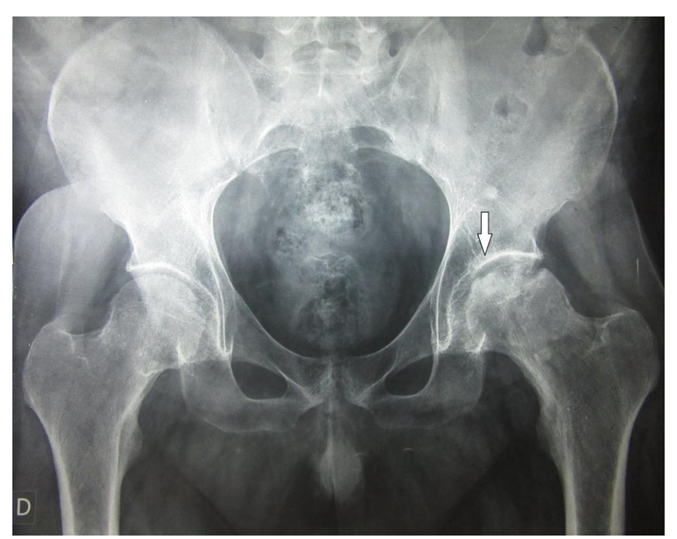
Figure 3: The pelvic X-ray showed a loss of sphericity of the left femoral head with an aspect of eggshell in favour of avascular necrosis of the left femoral head.